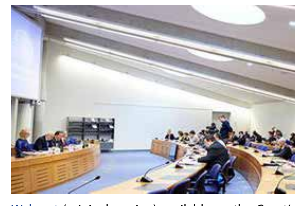
Webcast (original version) available on the Court's Internet site (www.echr.coe.int – Press).

The Court held its annual press conference on 25 January 2018. The President of the Court, Guido Raimondi, took stock of the year 2017. He referred in particular to the increase in the number of new cases, but said that a large number of applications had been declared inadmissible for failure to exhaust domestic remedies. In that connection he reiterated the importance of the principle of subsidiarity, which requires applicants to exhaust national remedies before applying to the Court.