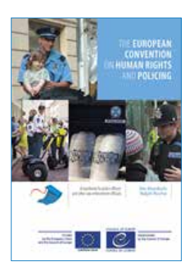
The European Convention on Human Rights and policing (eng)

The European Convention on Human Rights and policing v. A handbook for police officers and other law enforcement officials has been published in the framework of a Joint Programme between the European Union and the Council of Europe. It is a tool for the police and other State authorities to prevent and fight police misconduct or impunity and to uphold human rights. It can be downloaded from the Court's Internet site (<www.echr.coe.int> – Publications).